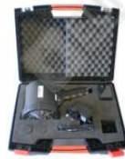
Optional carrying case